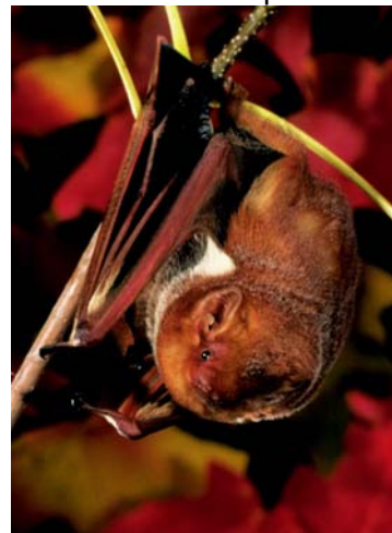
A male red bat