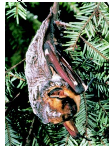
A hoary bat