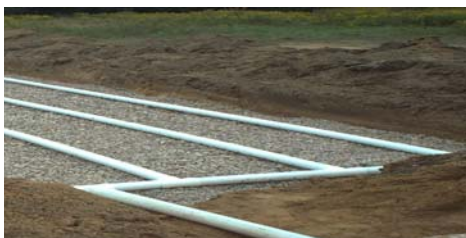
Figure 3: An example of the closed loop system found in an absorption bed.

Environmental Health Specialists design sewage disposal systems based on site evaluations. These evaluations reveal the highest elevation that the zone of saturation has reached in the soil profile. Sewage disposal systems are designed to allow adequate isolation between the bottom of the absorption field stone, and the highest indicated elevation of the saturated zone. This helps to minimize the risk of groundwater contamination by the sewage effluent, because the isolation allows for effective treatment of the effluent, as it passes through the unsaturated zone.