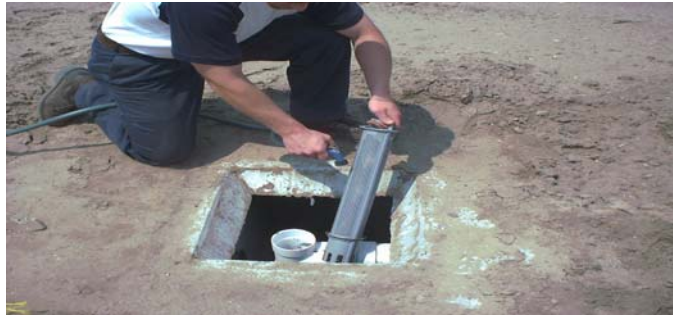
Figure 2: Hosing an effluent filter off into the septic tank

Effluent filters require periodic cleaning, in order to maintain proper flow of sewage effluent from the septic tank to the absorption system. To clean your filter, simply remove the filter cartridge from the outlet baffle or case, and hose the cartridge off, being careful to rinse septage material back into the septic tank (Figure 2 on the right). What you put in your septic system, and how much, will dictate the maintenance interval. Always refer to the manufacturers' recommendations regarding the maintenance of your effluent filter.