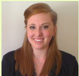
Cassie has breastfed two children.